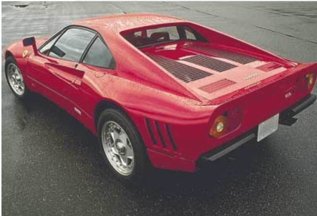
Figure 3.8. Improper GCR settings can cause bad transitions in a difficult image like this. Overleaf, note the defects in the black and magenta plates when the separation is done at the settings the correspondent used.

Better way still: separate at 85%–320. Shadow should now be something like 85C75C75M85K. This is too dark, of course, but